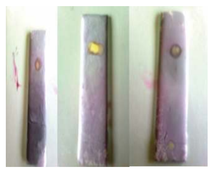
Raw Spinach Boiled spinach Freeze spinach

As shown in figure 5, yellow band formed against the purple background helps us to determine the antioxidant activity. Higher the yellow band more is the antioxidant activity. The order was Boiled spinach > Raw spinach > Freeze spinach.