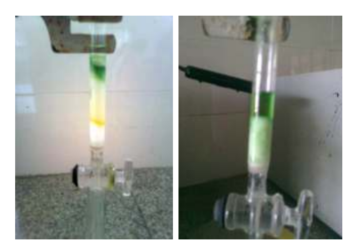
Figure 1 Separation of pigments in different spinach extracts

In raw spinach sample four bands (dark yellow, light yellow, dark green, light green) was separate out, in boiled spinach three bands (dark yellow, light yellow, light green) were separate out but the dark green band was missing because chlorophyll-a was degraded during boiling process. In freeze spinach two bands were separate out (dark yellow, dark green) light green and light green was missing because pheophytins degraded during freezing process due to pheophytinization.