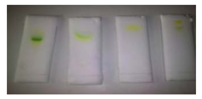
Dark green Light green Dark yellow Light yellow Figure 2 Separation of pigments in raw spinach.

As shown in figure 2 raw samples contains all the pigments and separated as dark green, light green, dark yellow and light-yellow band by thin layer chromatography.